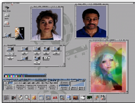
AmigaOS under Emulation

ImageFX is one of the leading image editing and digital special effects packages developed for the Amiga. It combines painting, image file format conversion, image processing, and special effects. ImageFX was first released by Nova Designs, Inc way back in 1992 and quickly became the required graphics application for all Amiga owners becoming an integral part of Video Toaster/Flyer owner's toolkit. Over the years it has received many upgrades. ImageFX 4.0 introduced a powerful but easy to use animation system with support for full colour as well as palette mapped and greyscale animations. The latest version, ImageFX 4.5 Studio , is supplied on CD-ROM and is compatible with AmigaOS , AmigaOS 4 and MorphOS as well as under emulation with WinUAE , E-UAE and Amiga Forever . The latest